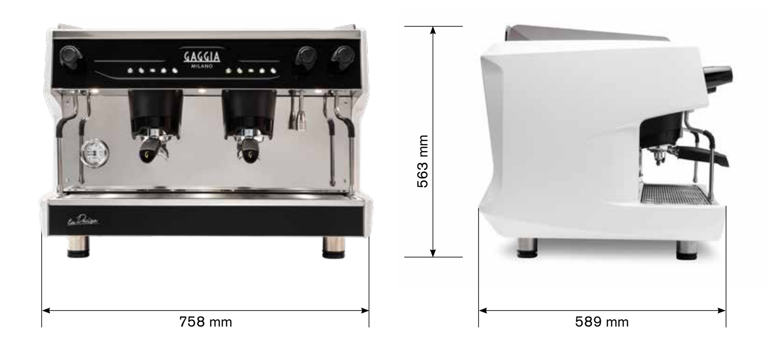
WEIGHT: 58 Kg