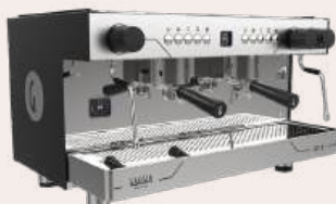
GT 3 2GR BLACK