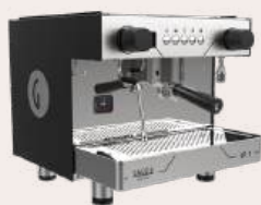
GT 3 1GR BLACK