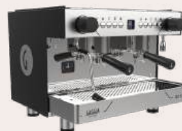
GT 3 2GR COMPACT BLACK